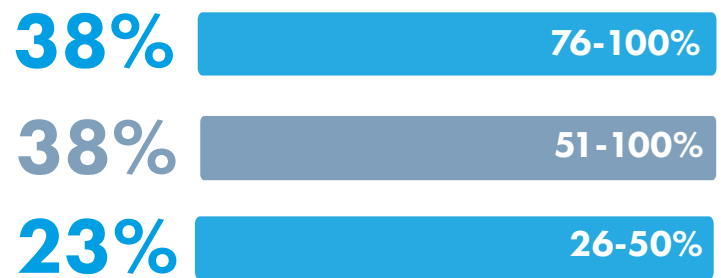
Figure 4: LATAM - How much of your client relationships are technology-based today (using mobile apps, online platforms...)

New players sometimes have the opportunity to leapfrog more established rivals in the uptake of new technologies. This can be seen in client/WM relationships, which are more technology based in Latin America compared to other regions: 38 percent of surveyed WMs said that 76-100% of their client relationships were technology-based. (figure 4)