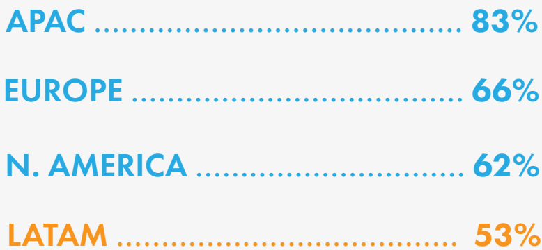
Figure 7: The use of AI among wealth managers will be the key differentiator and it will determine whether I remain or leave my current wealth manager