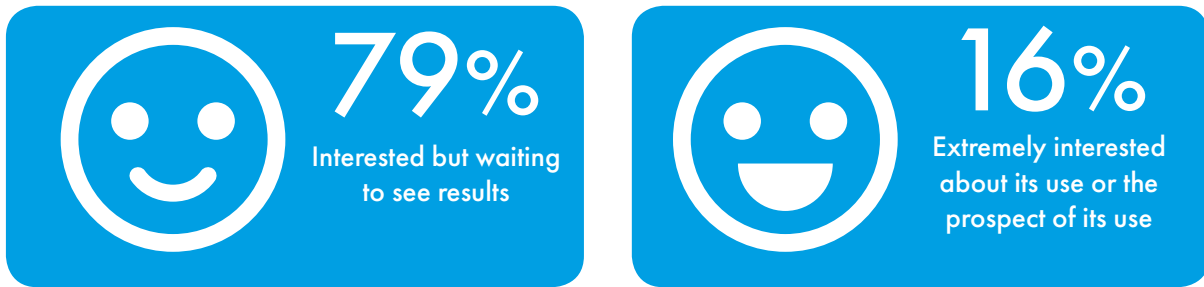
Figure 5: What is your attitude about the use of AI in managing your wealth?

Percentage of HNWI's surveyed who agree or strongly agree with the following: